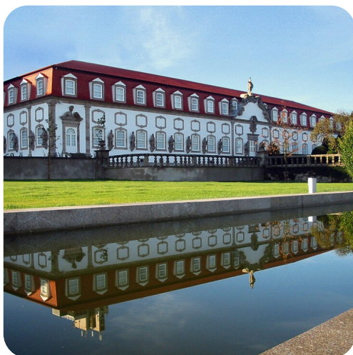
Palácio Vila Flor